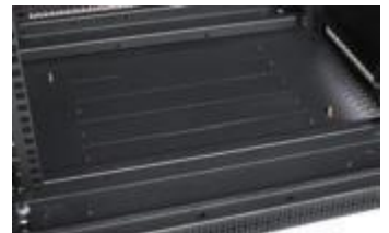
Moveable bottom panel for easy cable management