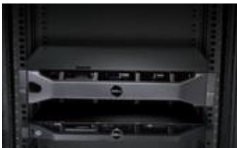
U marking is still visible after mounting equipments.