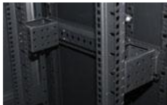
Adjustable Mounting rails & Spacer